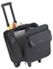
Laptop Rolling Case

Great Deals: Laptop Rolling Case: Going away for the holidays and need to take your Mac with you? Keep it protected and easy to drag through the airport with this Laptop Rolling Case. I used one when teaching Mac repair classes all over the country. Believe me, it was a God send especially when you're running through the airport trying to make your connecting flight. Just remember to take it out of the case and keep it with you in your seat or you'll be calling me when you crack the display trying to shove it into the overhead bin. Get it at Big Lots for $25 bucks! God, I love that store! Click here for details: Big Lots